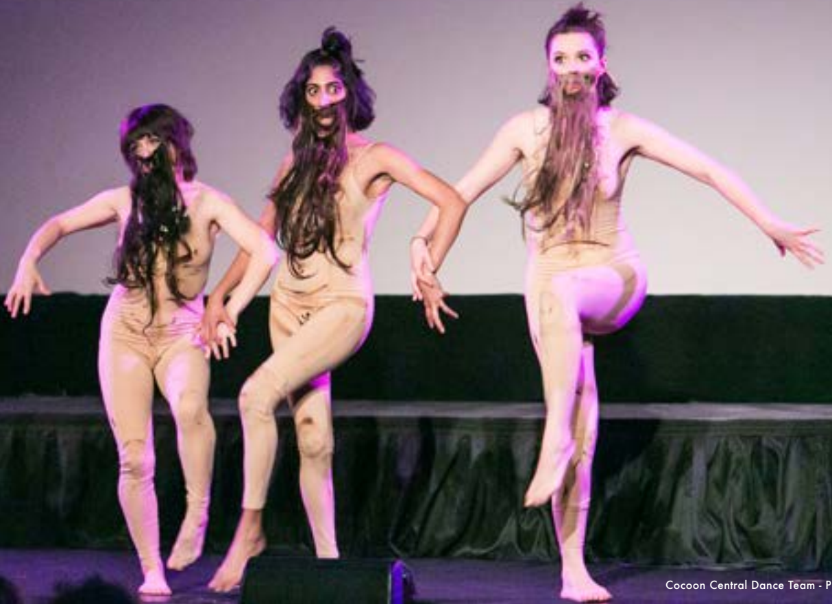
Cocoon Central Dance Team